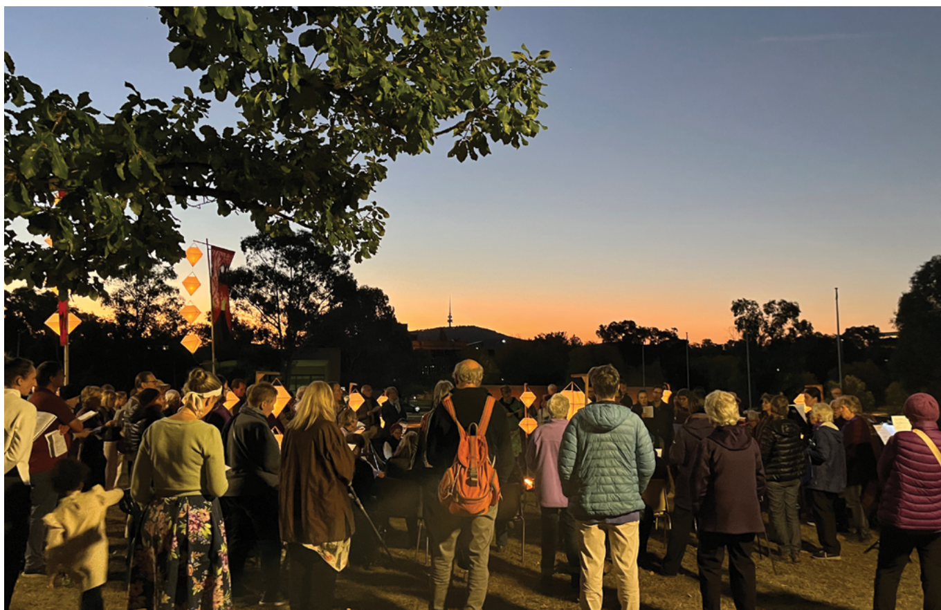
Dusk sets in