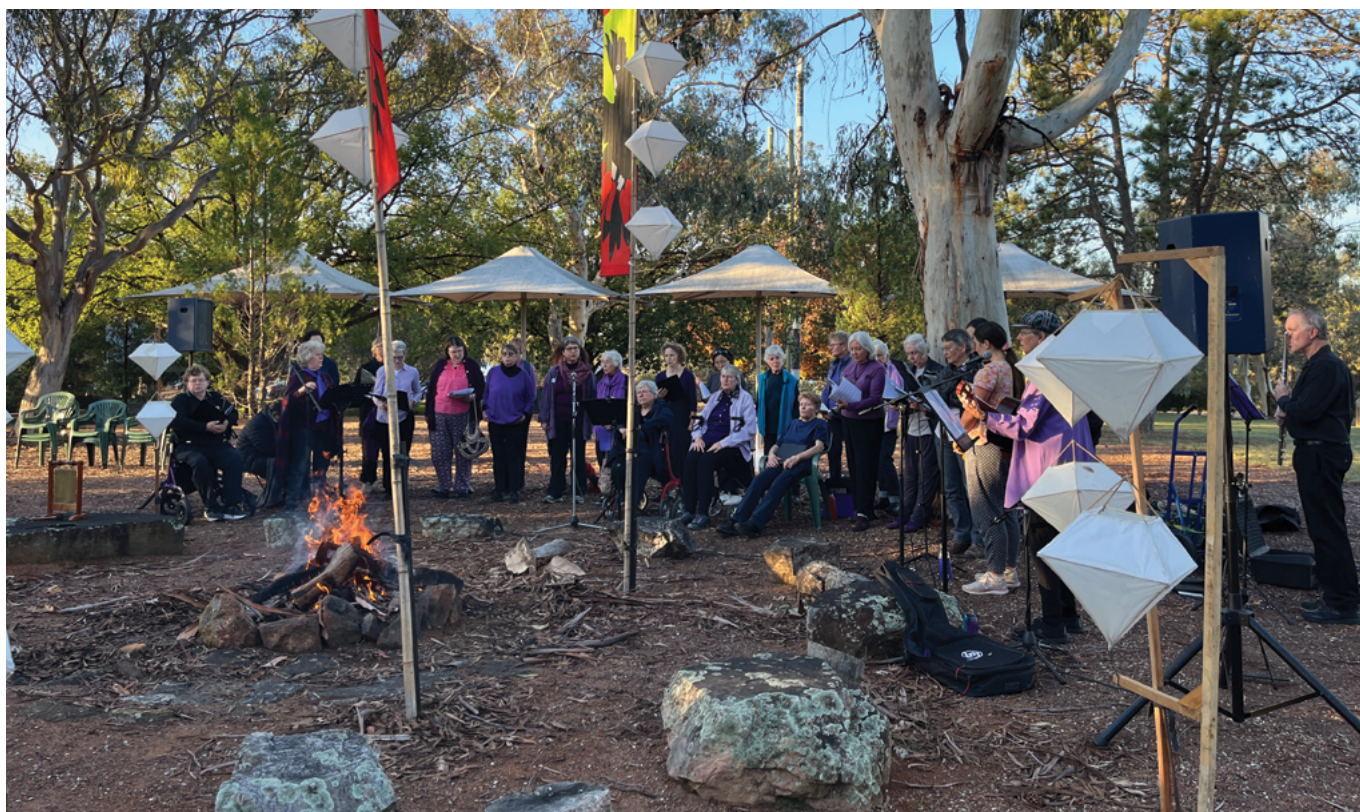
A Chorus of Women and Wayfarers